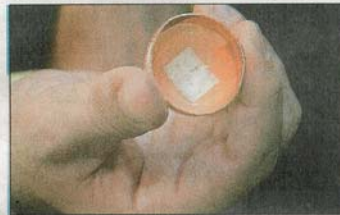
The inside of this table tennis ball holds a computer chip made using a device developed by Intelligent Micro Patterning.

In this case, university research led to the creation of the SF-100. The rights to manufacture and