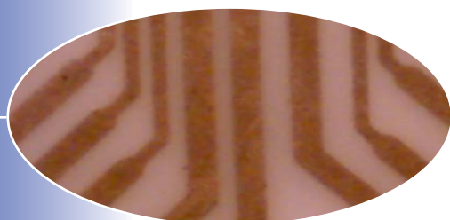
Metal Fodel Interconnects Patterned on the SF-100 (200X)