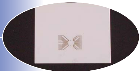
Fodel Interconnects on Ceramic Substrate