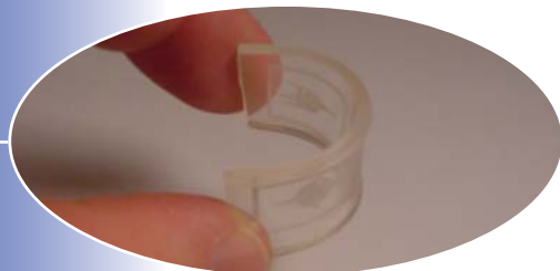
Demonstration of PDMS Flexibility