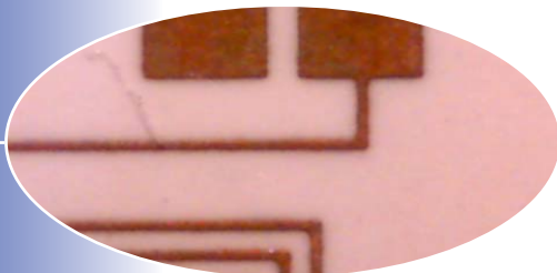
Magnified View of Bond Pad Area (60X).