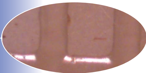
Magnified View of Acrylic Molded Part (60X)