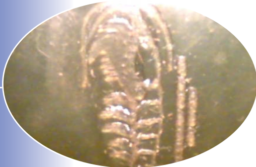
Magnified View of Finished Part (10X)