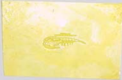
A Device Fabricated Through Direct Exposure of Press Plate. (Device is 0.5 cm x 1.0 cm)